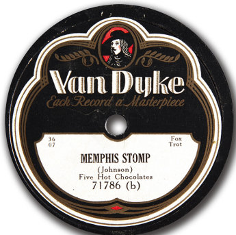
32. Five Hot Chocolates — “Memphis Stomp/ Shoo-Shoo-Boogie-Boo” VAN DYKE 71786 V+ MB $25