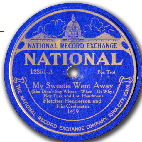
37. Fletcher Henderson And His Orchestra / JELLY ROLL MORTON — “My Sweetie Went Away (She Didn't Say Where— When—Or Why) / Muddy Water Blues” NATIONAL 1459 • E+ LEGENDARY JELLY ROLL MORTON RARITY! MB $400

This Jazz auction closes on Thursday, March 28, 2024 at 7:00 pm Pacific Time — DIFFERENT FROM VJM's AUCTION CLOSE DATE!