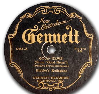
49. Kibbler's Kollegians — “Good News/ Clementine From New Orleans” GENNETT 6341 E+ TOUGH MB $300