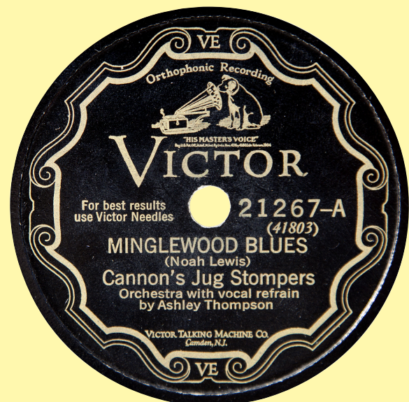
Cannon's Jug Stompers

19. Richard (Rabbit) Brown — "James Alley / I'm Not Jealous" VICTOR 20578 • E/E- ALL TIME MASTERPIECE!!! Almost never for sale because it is so well loved. MB $1,000