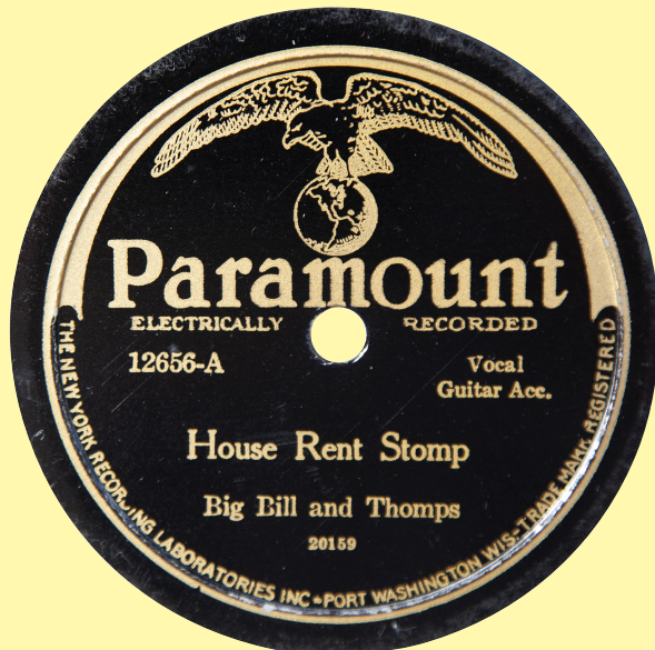
Big Bill (Broonzy) and Thomps